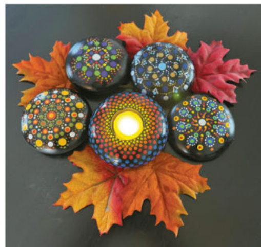
Mandala Rock Example

Have you ever wanted to tap into your creative side? Explore peace and relaxation while crafting an intricate, original Mandala Rock or Tea Candle. $30