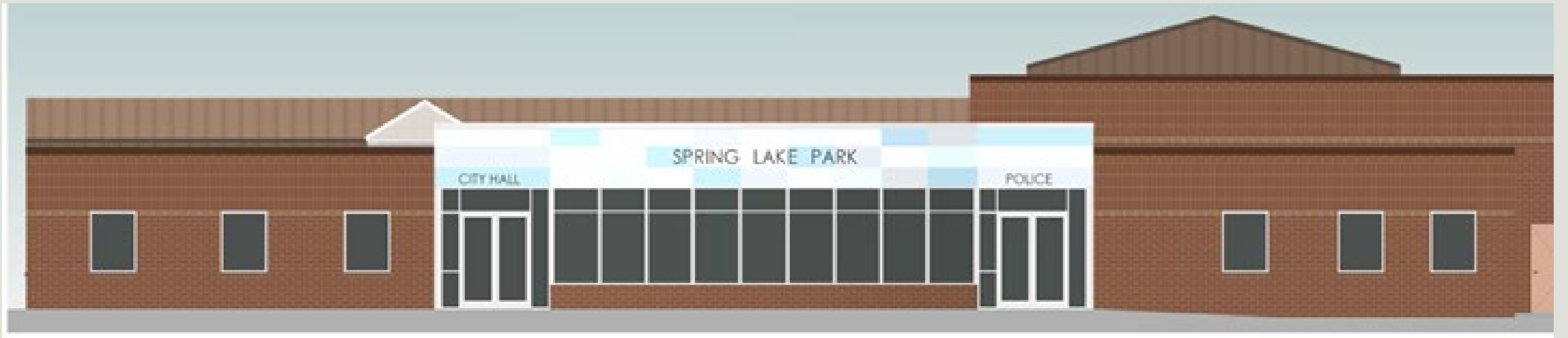
Proposed City Hall Improvements