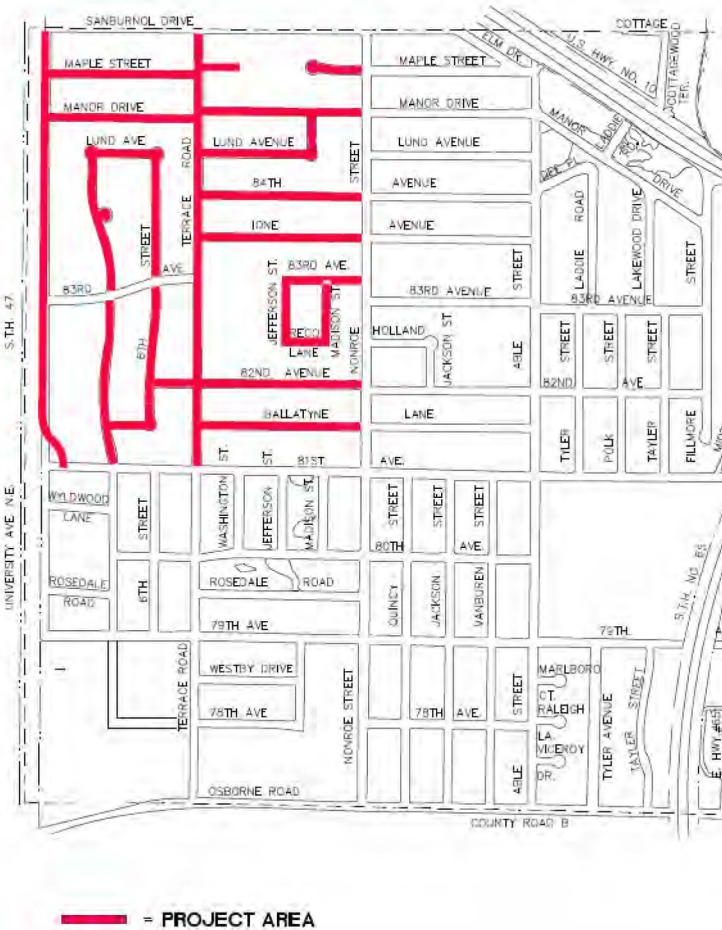
City of Spring Lake Park – 2024 Seal Coat Project

As part of the street maintenance, the city completes an annual street maintenance project consisting of crack repair and seal coating. Seal coating includes placing bituminous emulsion and small aggregate on the street surface. The 2024 construction area is for the northwest corner of the city (north of 81 st Avenue and west of Terrace Road), and pavement markings for the main streets in the entire city. Below is the map of the streets scheduled to be seal coated this summer.