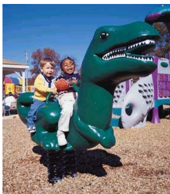
Dinosaur Adventure Mate