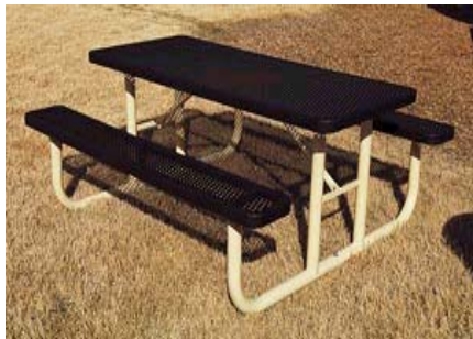
Bench ← Memorial Plaque can be Added to back