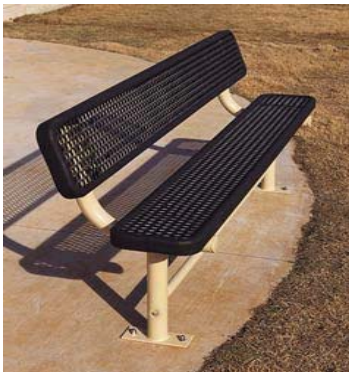
Picnic Table →