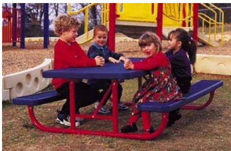
Preschool Picnic Table

6 foot Preschool Picnic Table..... $1000.00